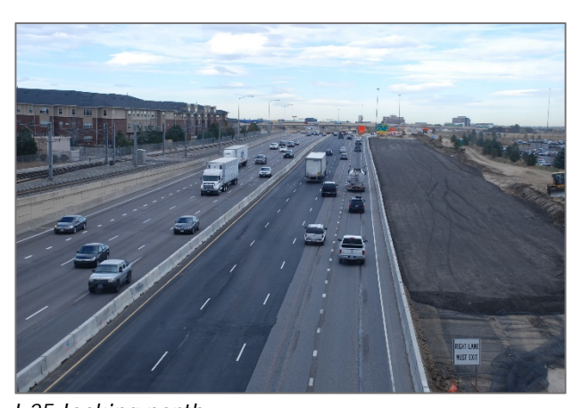
I-25 looking north