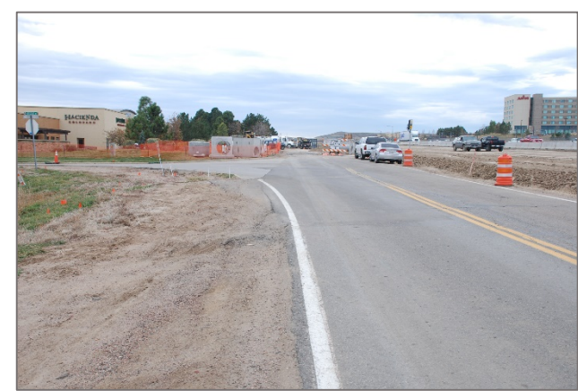
E. Beirstadt Way / San Luis Street intersection will be closed beginning late November 2014

A signed detour route will use immediately adjacent roadways. Delays should be minimal.